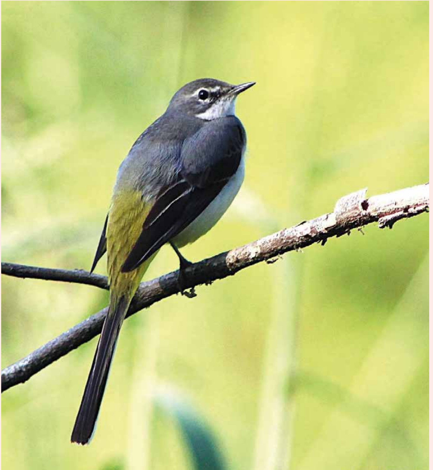
Yellow Wagtail Bird