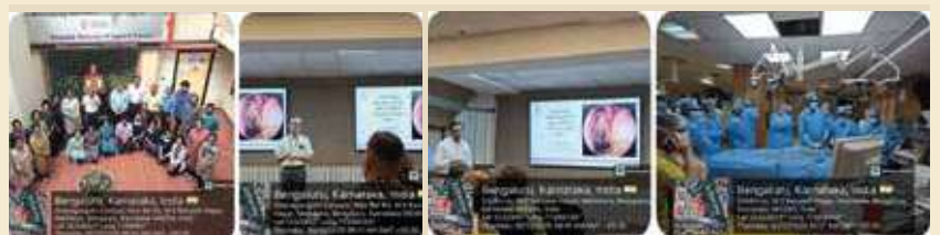
The Department of ENT conducted hands on cadaveric Endoscopic Sinus Surgery and Anterior Skull base Workshop on 30th and 31st October 2025 at Ramaiah Advanced Learning Center. 10 Hands on delegates from all over India attended the workshop and performed dissection under guidance of faculty.