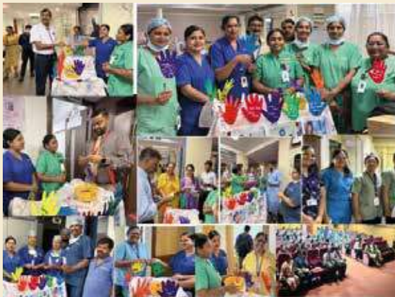
International Infection Prevention Week (IIPW) awareness programme was organised at Ramaiah Memorial Hospital to spread awareness among the patients.