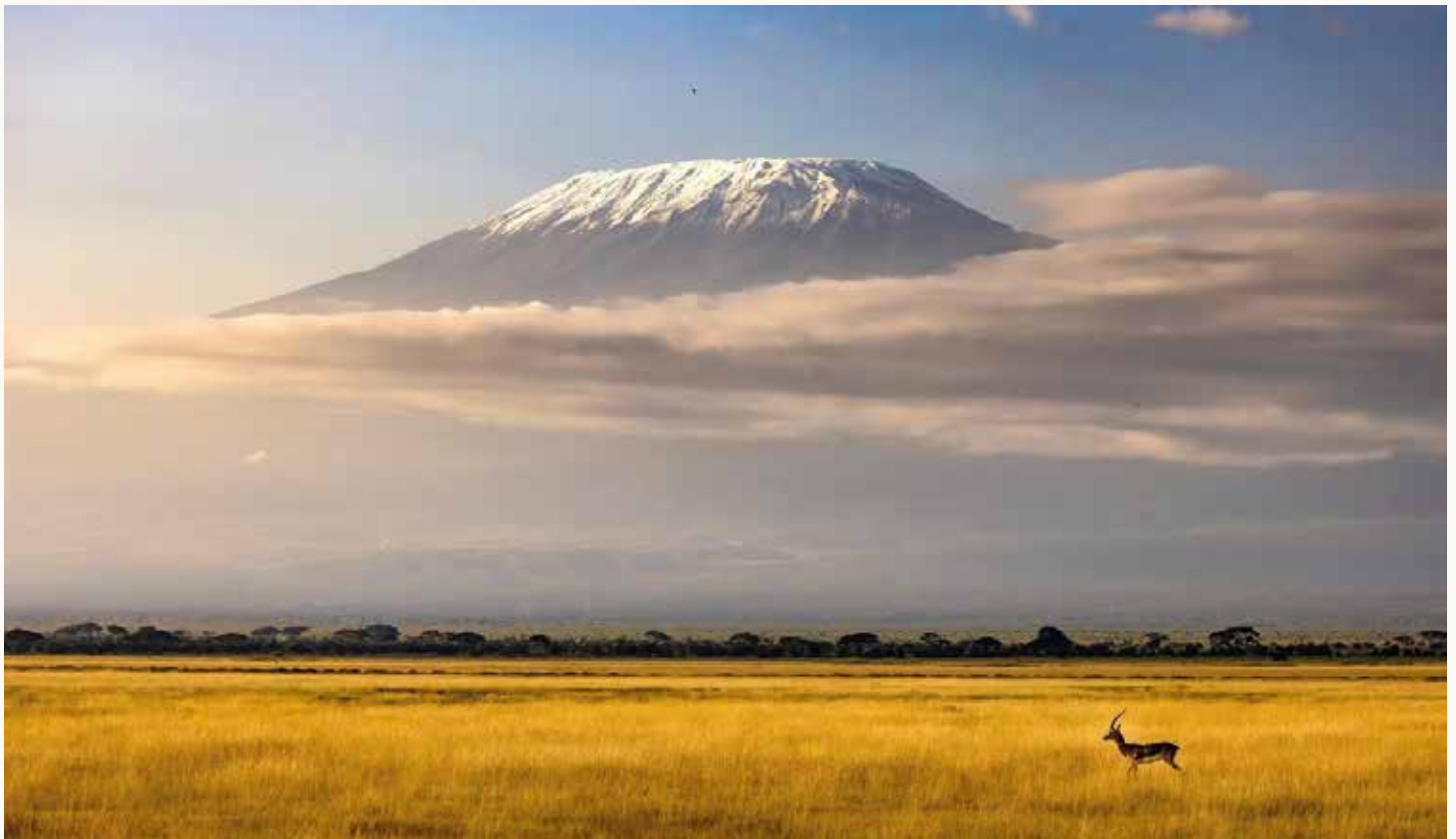
Kilimanjaro landscape with the Gazelle deer posing in front of the hills