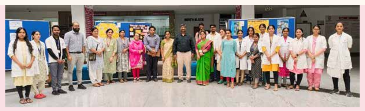
The Department of Microbiology organised World Antimicrobial Awareness week 2024 by poster presentation competition.