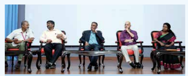
Inauguration of Interdisciplinary Community Based Training programme (IDCBTP) for MBBS Phase I students was organised on 29th May, 2023 at Ramaiah Medical College.