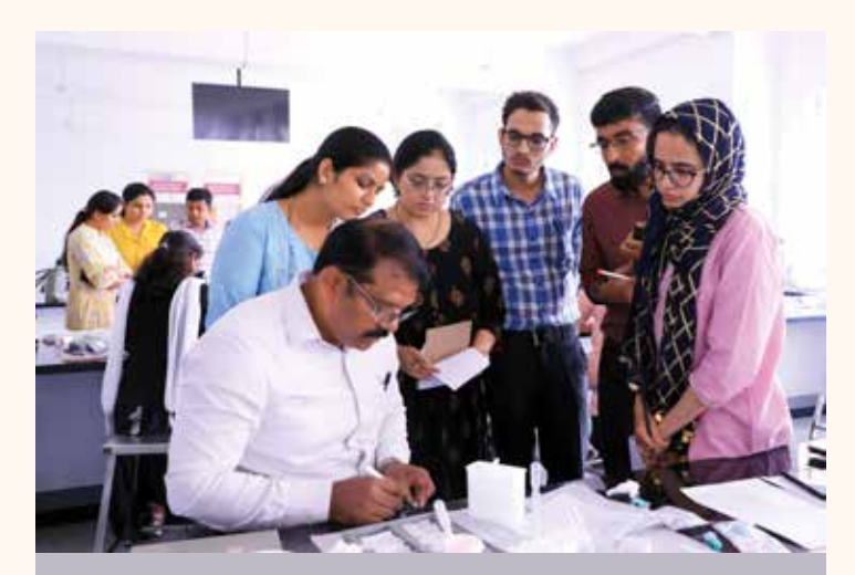
Department of Pathology and CYTELABS Bangalore in association with DBS organized D-I-Y Hands on IHC Workshop on 'Diagnose it yourself' on 13th & 14th May, 2023 at Ramaiah Medical College.