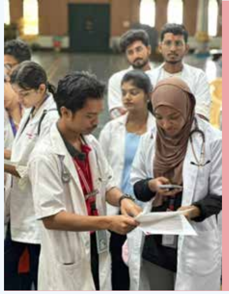
International Medical School conducted MSU Community programme in Akkimangala village on 4th June, 2023. 74 medical students participated in this programme.