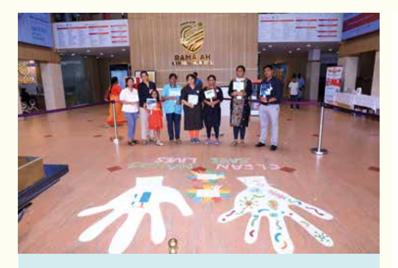
Ramaiah Memorial Hospital organized an awareness programme on Hand Hygiene Day on 5th April, 2023.