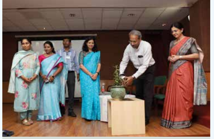
Dept. of Endocrinology organised a CME programme on the occasion of World Thyroid Day on 25th May, 2023 at Ramaiah Medical College.