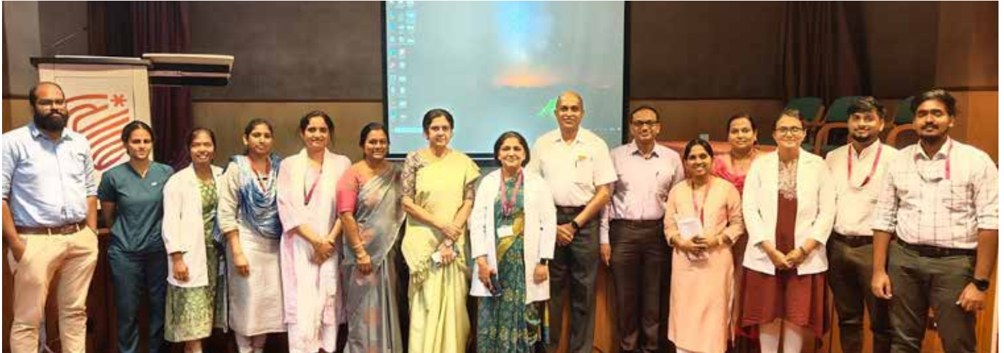
The department of Biochemistry and Microbiology organised a clinical society meeting on 'rare case-capsule discussion' by Pg students and faculty members on 1st March, 2024.