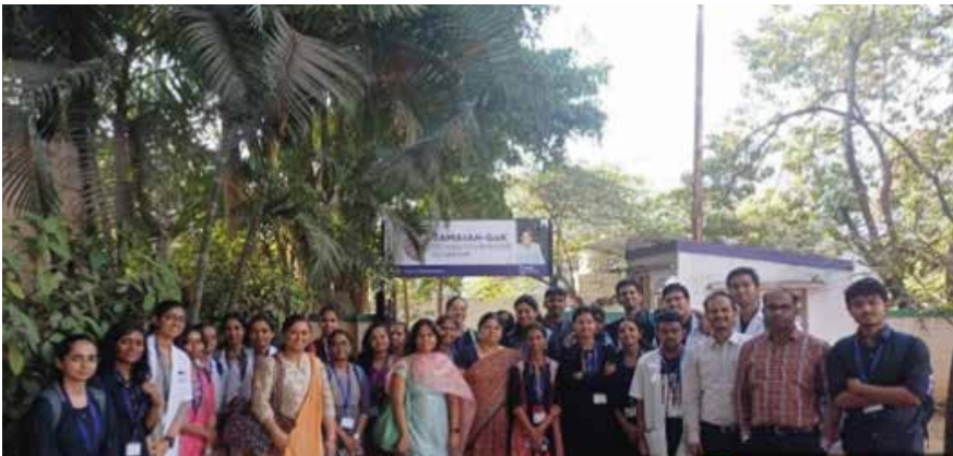
The Innovation Club arranged a field visit to the Ramaiah Technology and Business Incubation (RTBI) Centre, RUAS, Peenya. Twenty five students from MBBS Phase 1 and 2, primarily members of the innovation club participated in the field visit.

Ramaiah Ayurveda organized free Ayurveda specialty consultations for women throughout the month of March as part of International Women's Day. This was also a part of their continued yearly celebration of "Sthree BlissfulWomanhood" since its inception from 2021. A free BMD Camp was also conducted as a part of the celebrations.