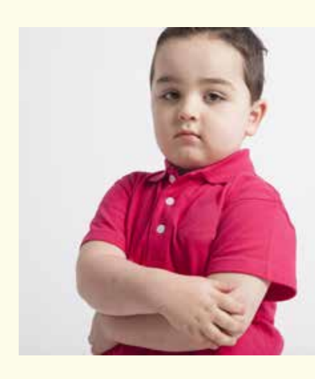
Is Your Child Overweight?

ಇತ್ತೀಚಿನ ದಿನಗಳಲ್ಲಿ ಮಕ್ಕಳಲ್ಲಿ ಸ್ಥೂಲಕಾಯ ಹೆಚ್ಚಾಗುತ್ತಿರುವುದು ಕಳವಳಕಾರಿಯಾದ ವಿಷಯವಾಗಿದೆ. ಭಾರತದಲ್ಲಿ 2003 ರಿಂದ 2023ರವರೆಗೆ ನಡೆದ ಸಂಶೋಧನೆಯಲ್ಲಿ, ಸುಮಾರು 186901 ಮಕ್ಕಳನ್ನು ಬೊಜ್ಜಿನ ಅಧ್ಯಯನಕ್ಕಾಗಿ ಬಳಸಲಾಗಿತ್ತು. ಈ