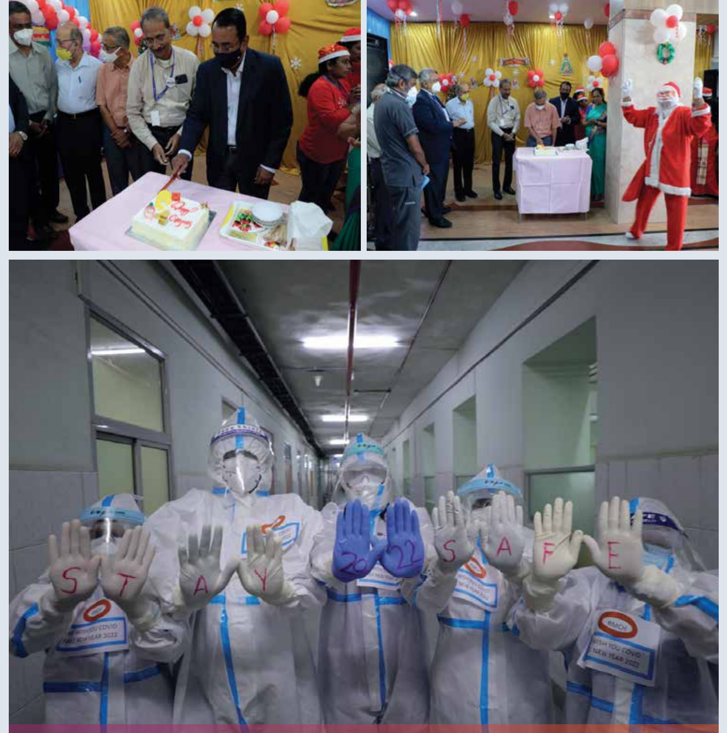
Ramaiah Hospital Health Care Workers Wishes everyone Covid Free - 2022