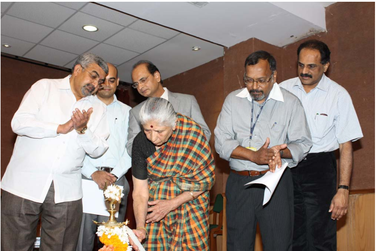
All the dignitaries and a representative of the donors lighting the lamp on the Dias.