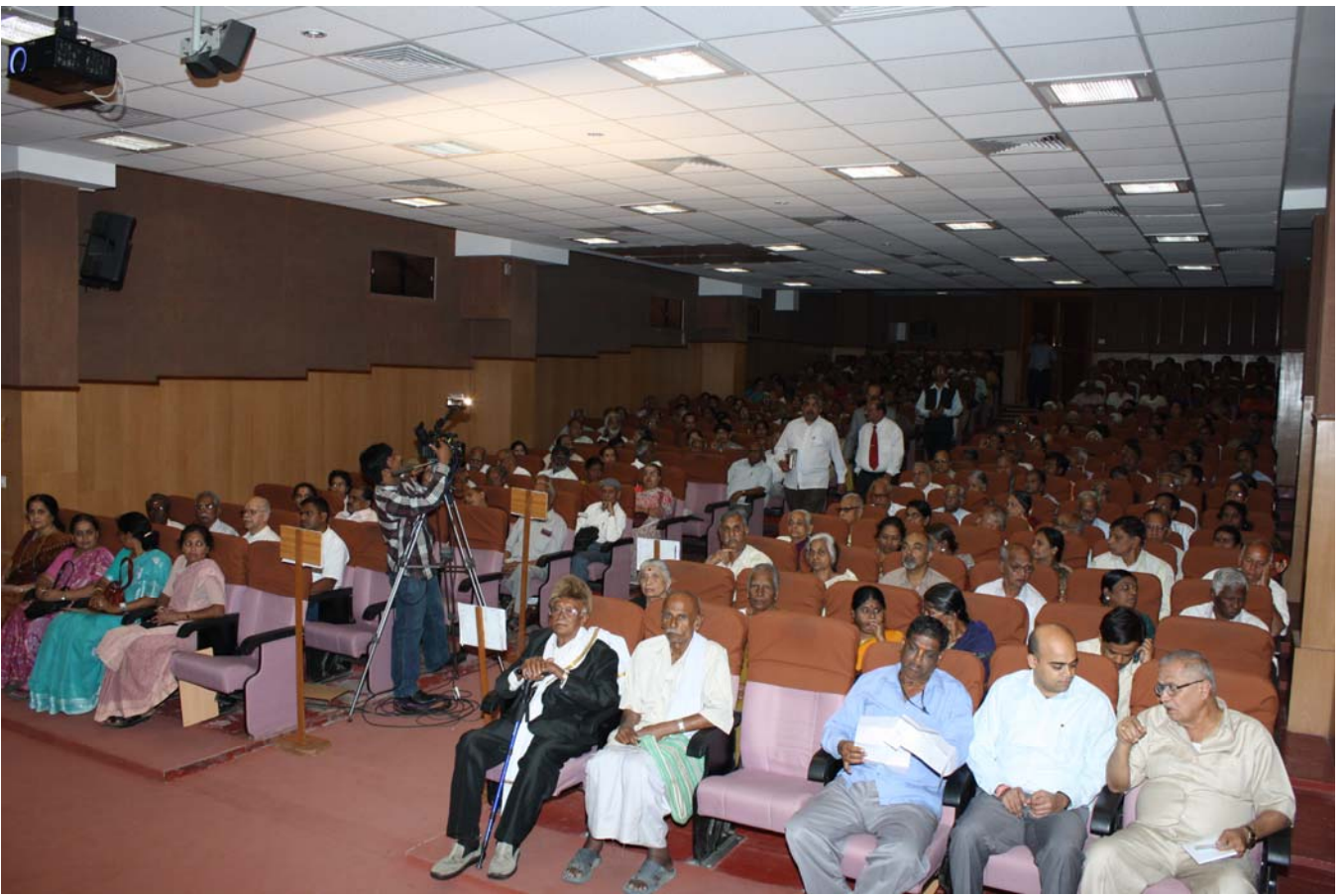
The audience of ABHNANDANA 2011 being seated in the auditorium