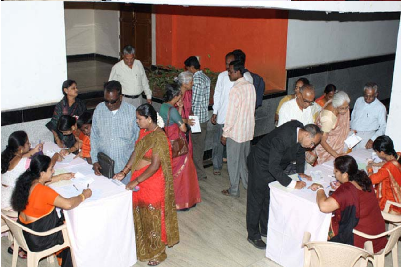
Registration process of the donors of ABHINANDANA 2011.