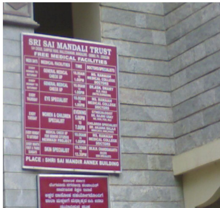
Sri Sai Mandali Health Centre.